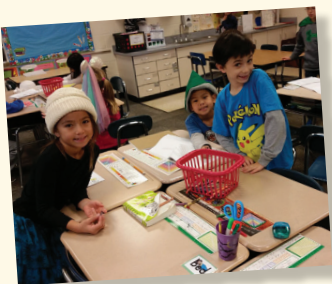
Members of the Make a Difference Club create activity books for kids who have to stay in the hospital.