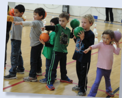
Westbrook Gym and Reading Night